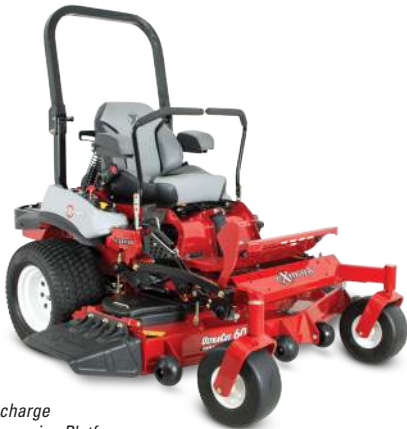
Side Discharge with Suspension Platform