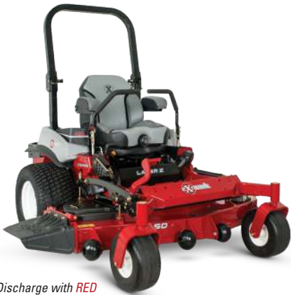
Rear Discharge with RED